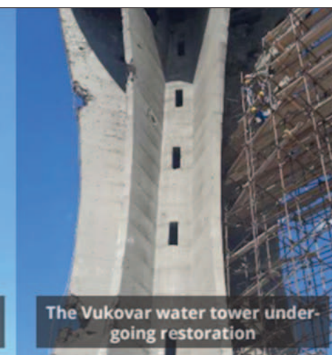
The Vukovar water tower under-going restoration