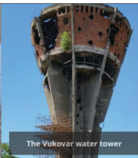
The Vukovar water tower